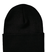
BLACK Black 6C

Textile fabric colours are subject to dye lot variation and will not be exact match to print Pantone reference