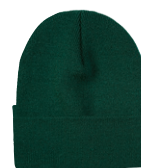
ATHLETIC GREEN 627C