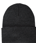
BLACK HEATHER** No PMS