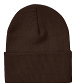
DARK CHOCOLATE 412C