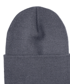
ATHLETIC OXFORD* Cool Grey 10C