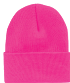
NEON PINK 806C