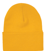
ATHLETIC GOLD 137C