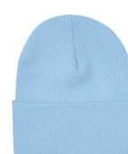
LIGHT BLUE 278C