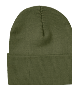
MILITARY GREEN 7771C