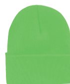
NEON LIME 802C