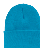
NEON BLUE 801C